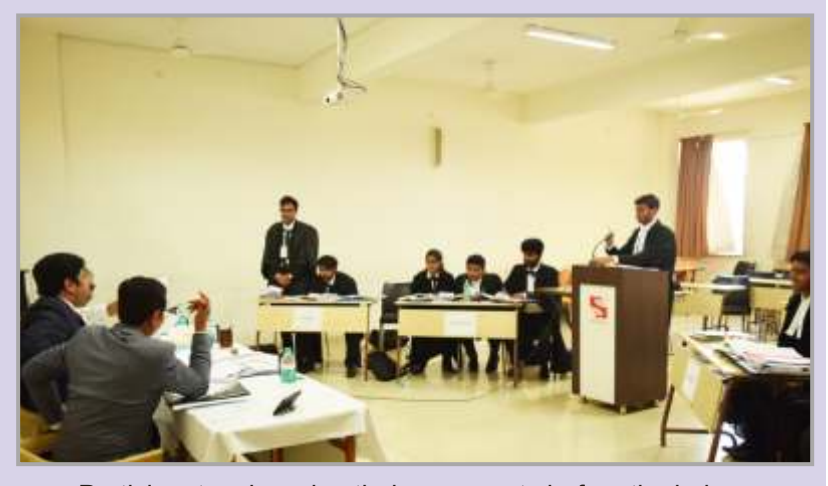
Participants advancing their arguments before the judges

Panel for the Opening Ceremony of SICTA 2019 The Fourth Edition of the Symbiosis Law School, Pune, International Criminal Trial Advocacy Competition (SICTA) was held from 28th March to 30th March 2019. The three-day competition hosted teams from 24 law schools including 2 foreign law schools namely, University of Bristol, UK and Nepal Law Campus, Nepal.