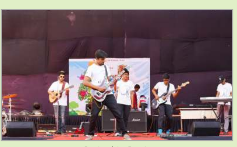
Battle of the Bands

The opening ceremony began with a spectacular dance performance based on Women Empowerment. It was followed by the play "Mere Hisse Ki Dhoop", based on the real-life tragic events of Rohingya refugees in India, brought to public attention by the judicial precedent of Lian Khan v Union of India.