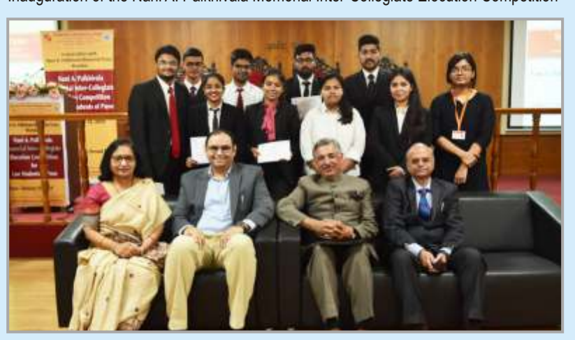
Participants of the Nani A. Palkhivala Memorial Inter-Collegiate Elocution Competition