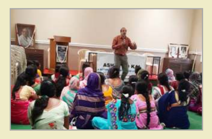
Training Session on Legal and Financial Literacy