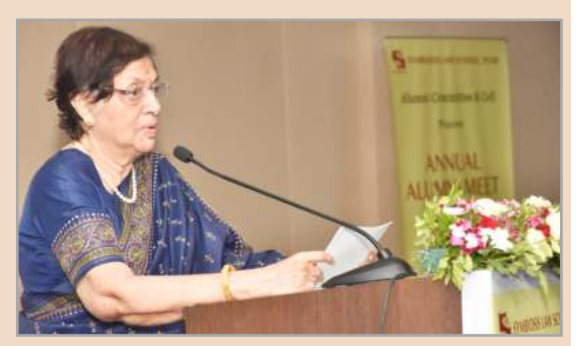
Chief Guest, Hon. Justice Sujata V. Manohar (Retd.), Former Judge, Supreme Court of India.